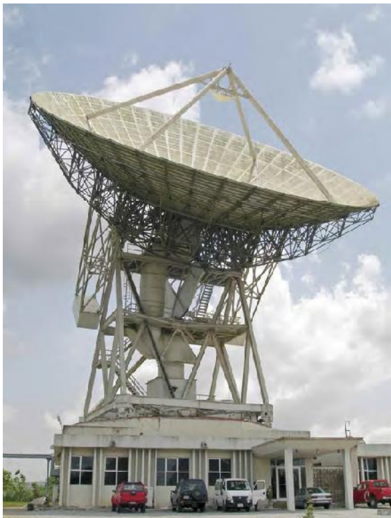
Figure 1. The Kutunse antenna in Ghana

The technologies and systems required for the AVN will require engineers to work at the cutting edge of design and innovation, such as better high-performance computing to manage the astronomical data and new manufacturing and construction techniques. The Kutunse radio astronomy station would be equipped with a hydrogen maser frequency standard providing frequency standard and reference frequencies for the receiver / signal chain, GPS receiver providing time standard for recording systems, wideband internet connection, etc. The most important spin-off, however, will be the generation of new knowledge and knowledge workers - young scientists and engineers with cutting edge skills and expertise in a wide range of scarce and innovative field.