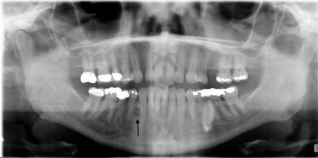
Figure 1. Orthopantomograph showing a well-circumscribed radiolucent area between #27-28 (arrow).