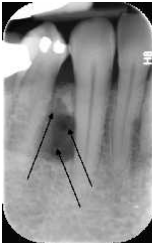
Figure2.Periapical radiograph showing multilocular appearance of radiolucent lesion (arrows).

On closer inspection of her panoramic and periapical radiographs (figures 1-2) the lesion was noted to have several loculations and was causing slight divergence of the tooth roots. Her intraoral exam revealed no bony expansion or tenderness over the area in question and teeth #27 and 28 tested vital. Her head and neck exam was unremarkable and the patient was a nonsmoker and did not consume any alcohol. A presumptive deferential diagnosis was made and included: Odontogenic Keratocyst, Ameloblastoma, Central giant cell granuloma, lateral periodontal cyst, BOC, and glandular odontogenic cyst.