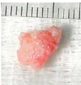
Figure 3. Excised lesion showing lobular surface. 8mm x 10mm.