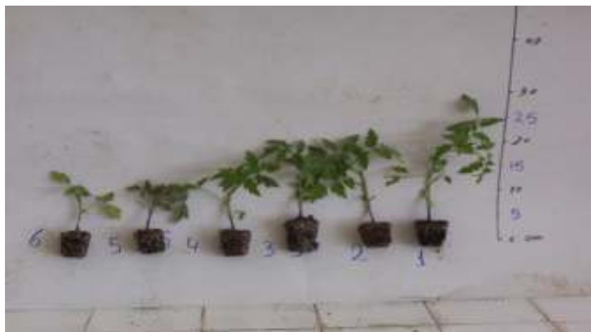
Fig (2) Effects of spraying tomato seedlings with Dextril on plant height. 1- Control. 2- Dextril 0.02%. 3- Dextril 0.04%. 4- Dextril 0.06%. 5- Dextril 0.08%. 6- Dextril 0.1 %.

Also, many studies reported that application of growth retardants like cycocel, significantly increased chlorophyll content compared to the control in groundnut ( Arachis hypogaea ) genotypes (Chetti, 1991). Foliar application of TIBA (50 and 100 ppm), Mepiquat chloride (500 – 100 ppm) and lihocin (500 – 1000 ppm) at 45 days after planting resulted in increased chlorophyll a, b and total chlorophyll (Pravin et al. 2001).