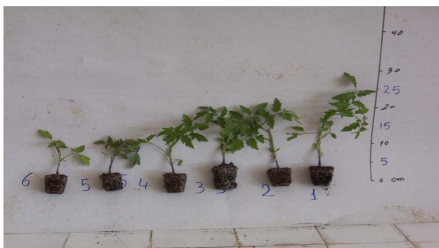
Fig (2) Effects of spraying tomato seedlings with Dextril on plant height. 1. Control. 2- Dextril 0.02%. 3- Dextril 0.04%. 4- Dextril 0.06%. 5- Dextril 0.08%. 6- Dextril 0.1 %.

The stimulatory effect of low concentration of Dextril on roots fresh and dry weight may due to the enhancement of root system growth, so, mineral absorption will be stimulated and this will reflects on shoot growth (Kanade et al., (2002).