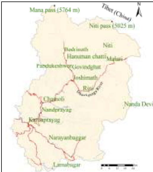
Fig. 3. Location of the villages covered under the study in Niti valley of Chamoli district.