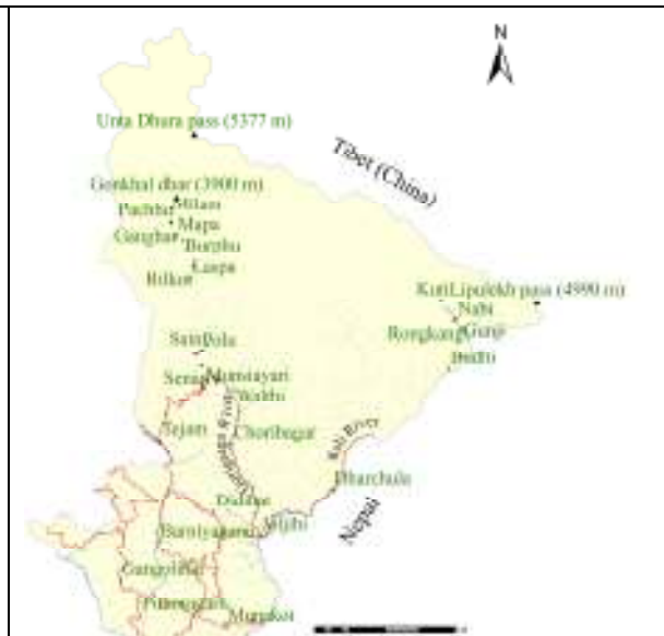
Fig. 4. Location of the villages covered under the study in Johar (Goriganga river) and Byans (Kali river) valleys of Pithoragarh district.

Bhotiya tribe constitutes majority population of the study area. Though agro – pastoralism is presently the major economic activity of the area trans-Himalayan trade used to be traditional pursuit of these people. For this they used to maintain large animal herds; particularly those of sheep and yak that were utilized for transporting various tradable commodities from terai, in the foothills of Himalaya that used to be their abode during harsh winter months, to Tibet traversing high-altitude passes and rugged Himalayan terrain.