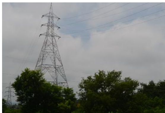
Fig. 1 Plants under high voltage agricultural fields in roop nagar area of Jammu

EMF on leaf mustard planted at different distances from the power line showed that the leaf mustard planted within 20 m from the power line had considerably higher protein, soluble protein, soluble nitrogen, and chlorophyll contents due to the higher EMF strength which decreased with increasing distance from the line. Higher EMF strength closer to the 275 KV power line resulted in higher peroxidase enzymatic activity, and chlorophyll content. Thus the new and energetic area of scientific research is the studies associated to the high voltage effects. In India, high voltage exposure is very common as shown in Fig. 1.