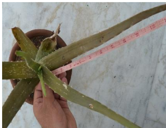
Fig. 6 Setup to record growth of Aloe Vera leaves

125 The exposed Aloe Vera leaf was kept under natural environmental condition for ten days i.e. 126 the control variables like temperature, humidity, sun light were maintained almost same for 127 all observations. The plant was watered every day. The Aloe Vera leaf was observed with 128 respect to change in physical properties like texture, colour and growth. The texture and 129 colour was observed by taking images of the Aloe Vera leaf and the growth was recorded by 130 a thick thread measured from the base of the leaf just above the root to the tip of the leaf. 131 The setup to record the growth of the Aloe Vera leaf is shown in Fig. 6. 132