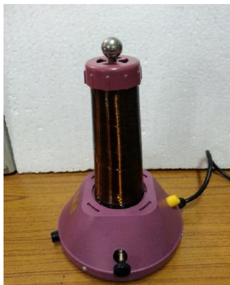
Fig. 3 Tesla coil

The investigations were carried out on Aloe Vera plants to study the effect of high voltage on the leaves with respect to texture, colour, and growth. In this research, the photograph of Aloe Vera leaf before high voltage exposure was taken and it was studied. After that the Aloe Vera plant was exposed to high voltage. The Tesla coil shown Fig. 3 was used to produce high voltage of order 50 KV.