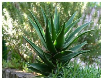
Fig. 2 Aloe Vera

Aloe Vera has extensive applications in Ayurveda for its anti-burn effect. It also acts as a tonic, antiseptic, antibiotic, anti-diarrheal, anti-fungal, anti-viral, and also a good hair conditioner [11]. In Ayurveda, which is also the traditional medicine of India, Aloe Vera has manifold uses such as it is used as a laxative, in haemorrhoid remedy, and as a uterine stimulant. It is also use to treat eczema or psoriasis [12]. Recently, Aloe Vera has been used to treat canker sores [13]. The most important part of Aloe Vera is Aloe gel. Aloe Vera gel is 99% water. It has a pH of 4.5 and is a common ingredient in many non-prescription skin salves. The gel also consists of the bulk of the leaf substance, which serves as the water storage space organ for the plant. In addition to this, the Aloe gel consist of polysaccharide, glucomannan, etc. [14].